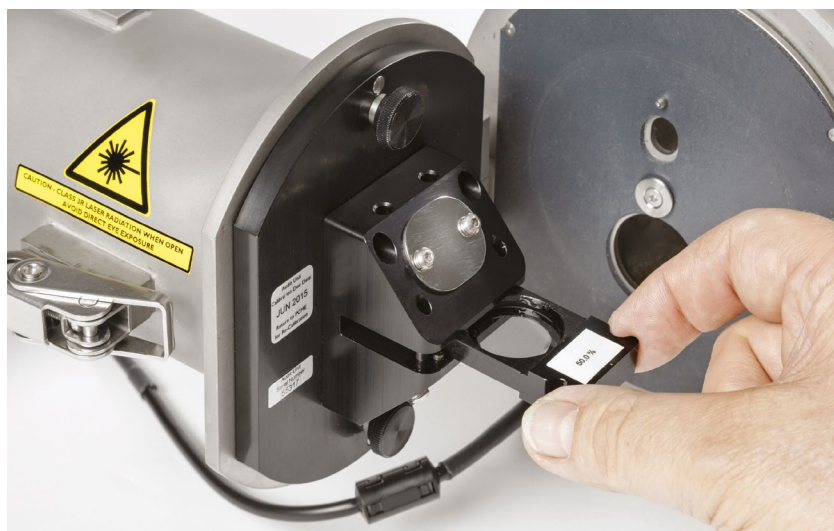
PCME QAL 360 shown with a multi-value Manual Audit Unit and attenuator

The automatic contamination check system (patent pending) ensures that any optical variances are measured, defined and adjusted to ensure zero and span drift is kept to a minimum.